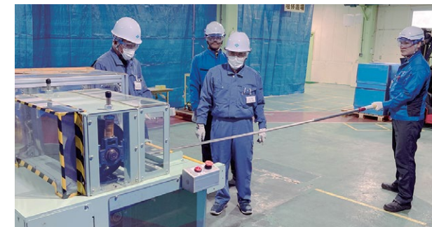
On-site hazard training course

The Sumitomo Metal Mining Group's on-site hazard training course and our hazard simulation training were also conducted in FY2024, with 460 employees taking part. Trainees gained firsthand experience with hazards such as blind spots for forklifts, slipping hazards, getting caught in cylinders and rotating objects, working at heights, handling heavy objects, cutting hazards, liquid splashes, hot-object hazards, and drum handling.